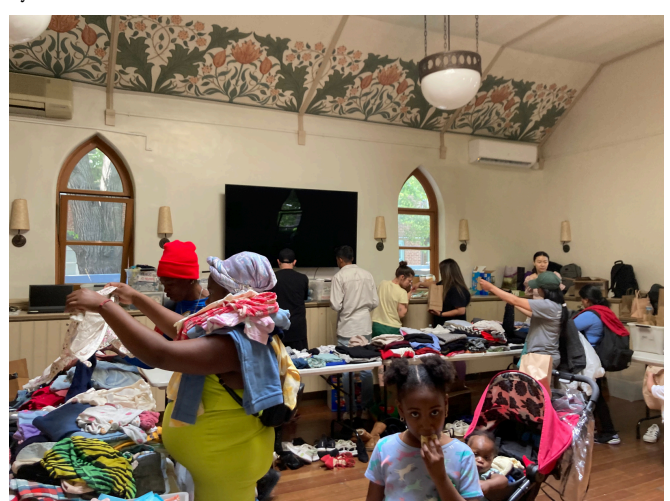
Community Closet guests stocking up on summer clothing