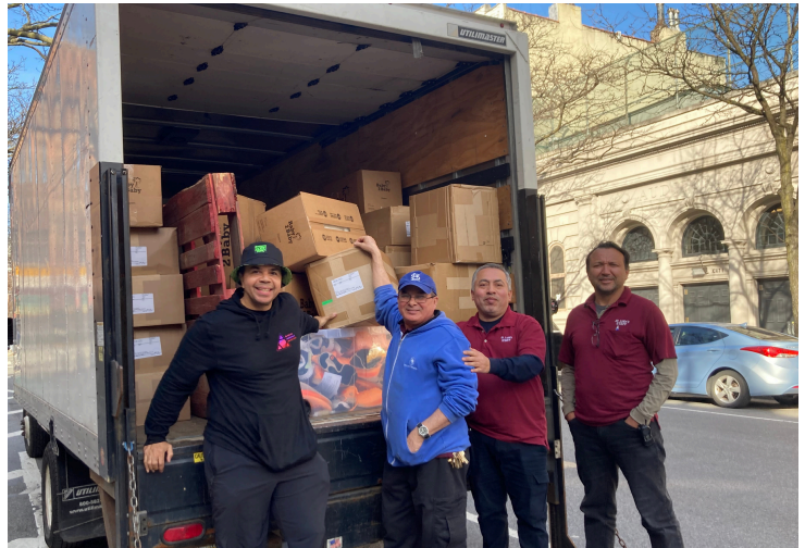
A truck-full of donated clothing and diapers delivered by Artists.Athletes.Activists