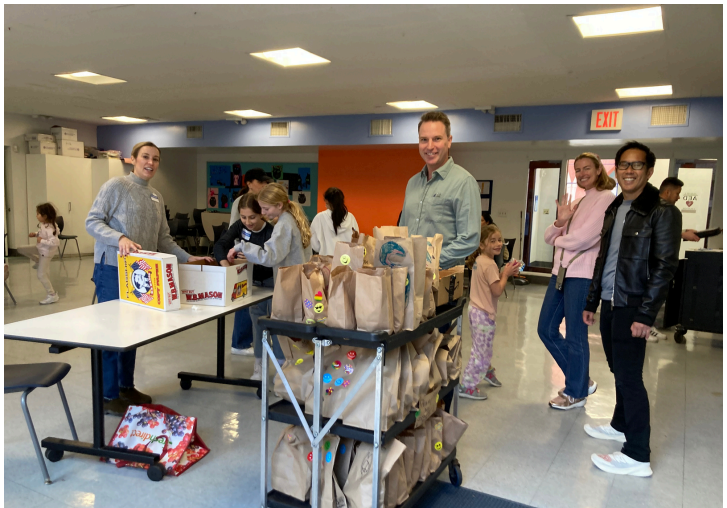
Families from St. Luke's School making lunches for our Community Closet