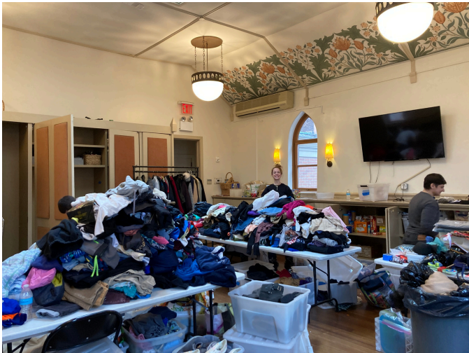
Volunteers organize our Community Closet