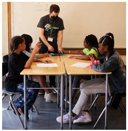
GO Project at St. Luke's