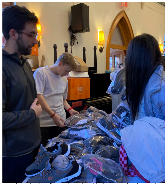
Distributing hundreds of sneakers (and baby supplies!) purchased with a generous grant by the Church of Jesus Christ of Latter-day Saints