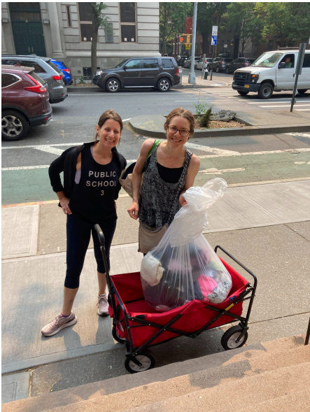
Moms from P.S. 3 drop off clothing donations