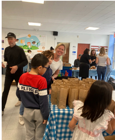
St. Luke's School families make lunches for Community Closet