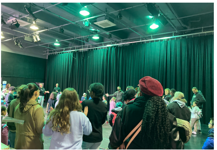
Morning Harambee (singing together) to start the day at GO Project at St. Luke's