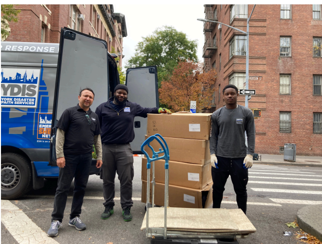
NY Disaster Interfaith Services donates 300 new winter coats for our Winter Coat Drive