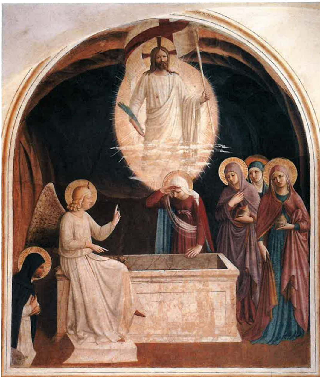
Women at the Empty Tomb, fresco by Fra Angelico, (circa 1395–1455)

April 5, 2026 at 9:30 a.m. Resurrection of the Lord