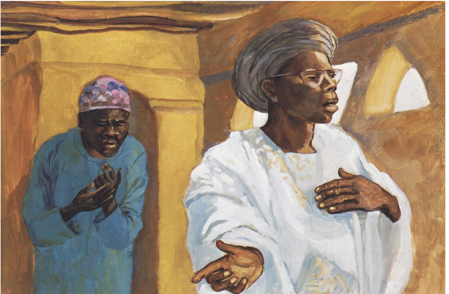
JESUS MAFA. The Pharisee and the Publican, from Art in the Christian Tradition, a project of the Vanderbilt Divinity Library.