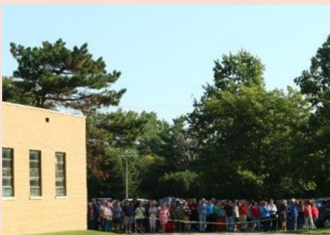
A crowd lines up next to the gym to be let in to the Sisters' historic, giant garage sale.

On June 11, our 69-year-old gym was demolished. In its early days it was used by Sacred Heart High School students. In more recent years it housed the treasures for our past garage sales and was the starting line of the sale on opening morning.