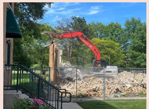
The last wall of the gym comes down.