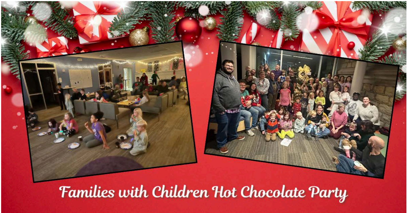
Families with Children Hot Chocolate Party