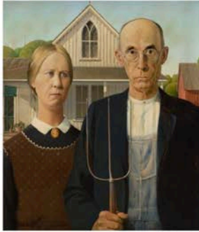
American Gothic, Art Institute of Chicago

Highland Baptist Church 1101 Cherokee Rd Louisville, KY 40204