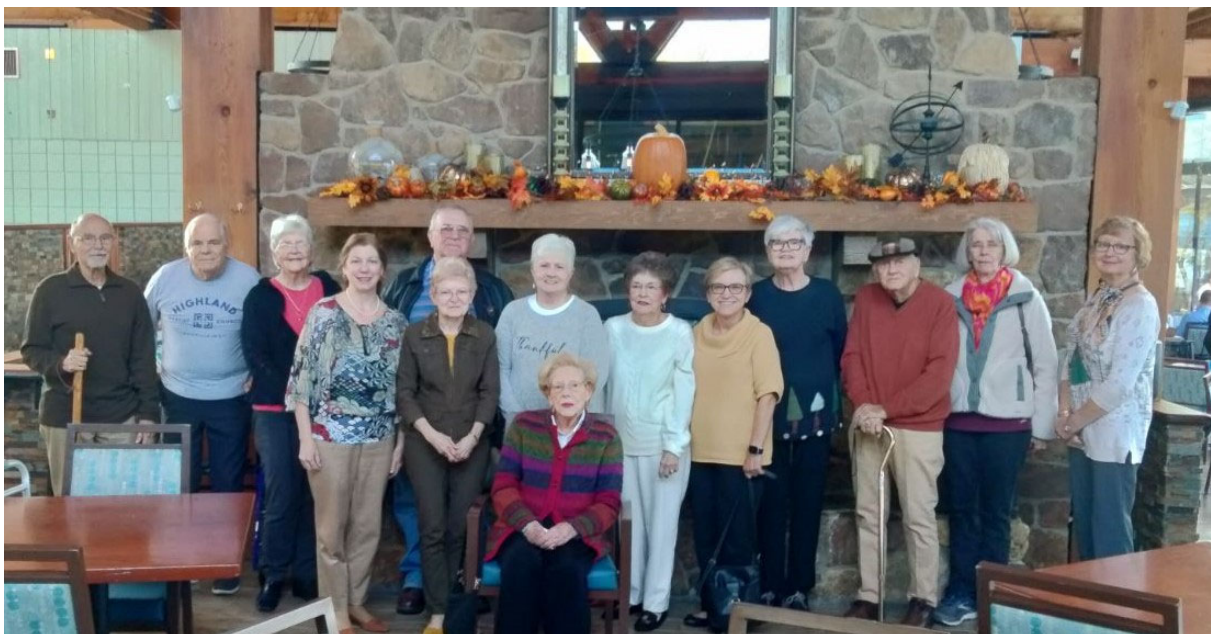
Captain's Quarters Lunch Outing on November 14