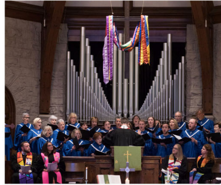
PRIDE SUNDAY @ HIGHLAND JUNE 16TH