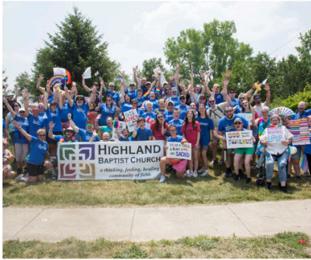
PRIDE PARADE AND FESTIVAL JUNE 15TH