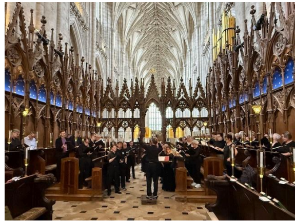
The quire stalls of Winchester where Coro Louisville sang a lunch concert and a Choral Evensong