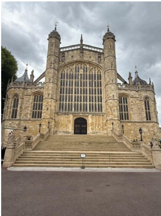
St. George's Chapel at Windsor