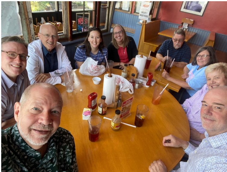
Highland's staff enjoyed Mark's Feed Store on Bardstown Road once more before it (sadly) closes.