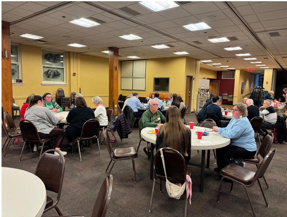
Senior and young adults enjoyed gathering for games and fellowship on Sunday evening, January 11.