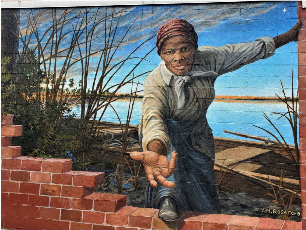
Harriet Tubman mural in Cambridge, Maryland

I said to the Lord, "I'm going to hold steady on to you, and I know you will see me through."