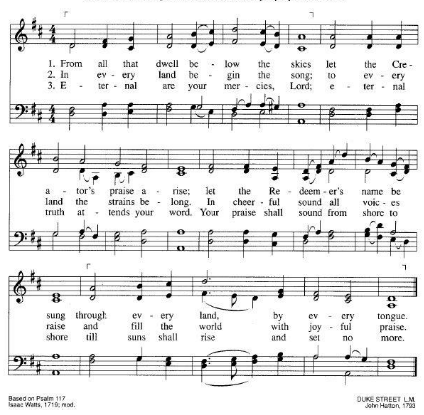
Hymns from Trinity Hymnal used by permission of Great Commission Publications

Praise the LORD, all you nations; extol him, all you peoples. Ps. 117:1