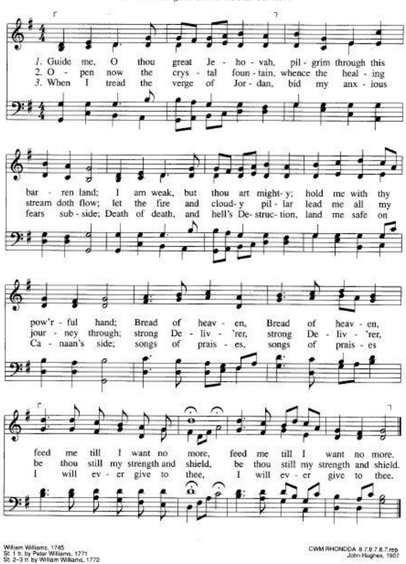
Hymns from Trinity Hymnal used by permission of Great Commission Publications

He will be our guide even to the end. Ps. 48:14