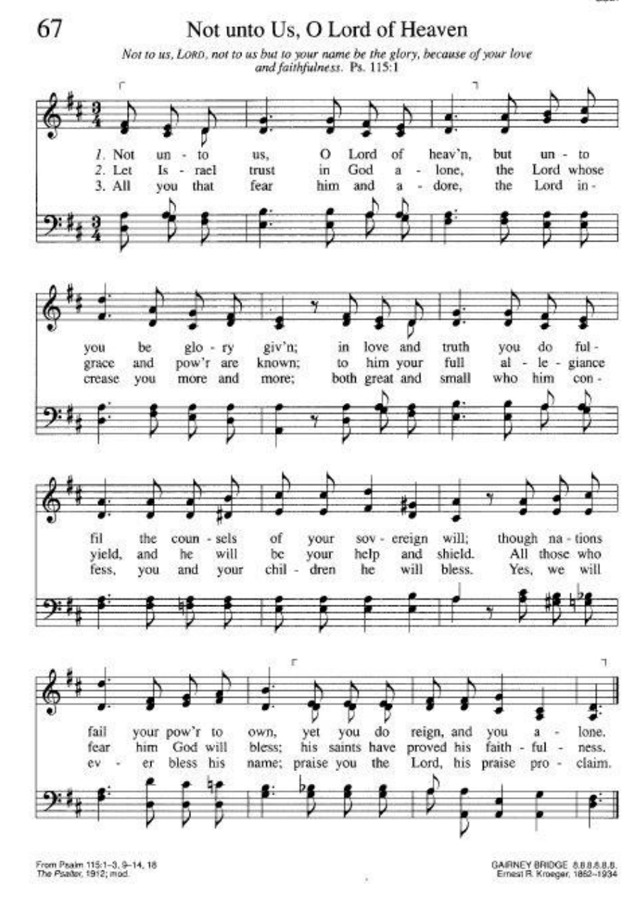
Hymns from Trinity Hymnal used by permission of Great Commission Publications