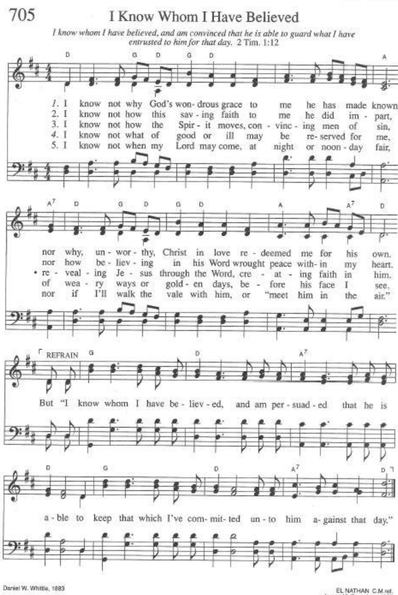
Hymns from Trinity Hymnal used by permission of Great Commission Publications