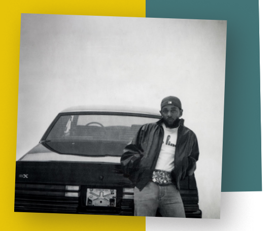
As chosen by Billboard staff