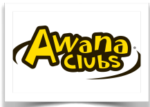
AWANA Clubs International