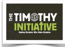
Timothy Initiative (South Asia)