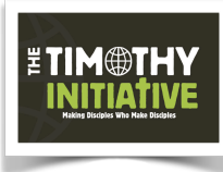
Timothy Initiative (South Asia)