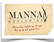
MANNA Worldwide (Zambia Kids)