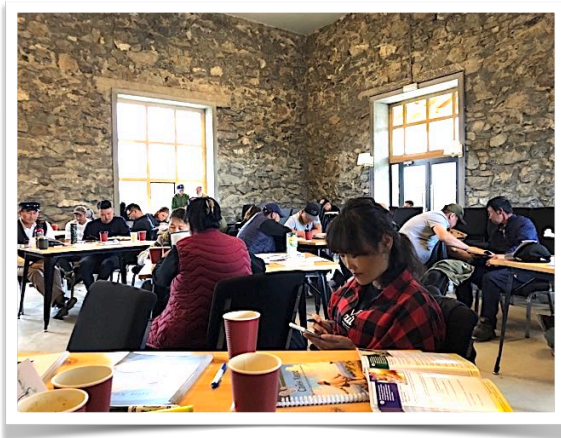
Missions Training in our newly heated building!