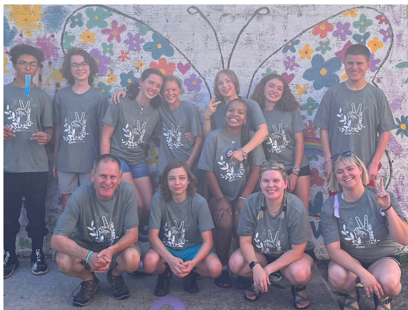
Huge smiles during the Block Party at The Dwelling