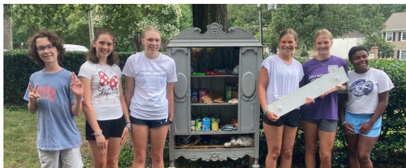
Arthur's Group Filling Blessing Boxes AKA Free Little Pantries