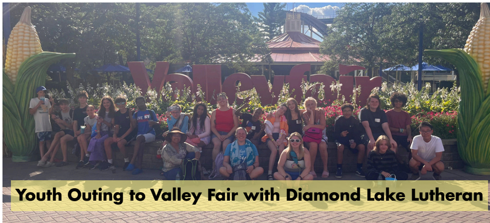
Youth Outing to Valley Fair with Diamond Lake Lutheran

Near and far, RALY went on adventures and made new friends while partnering with Oak Grove and Diamond Lake Lutheran Churches to share in the fun!