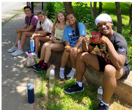
Lunch on Pilgrimage Day

This summer, nine high schoolers from RALY and Diamond Lake Lutheran drove to North Carolina! Alongside new friends, we gardened, painted, fixed bikes, prepared food, and danced in the name of "being the spark" we hope to see in the world, inspiring those around us to do the same! Here are some of our favorite moments: