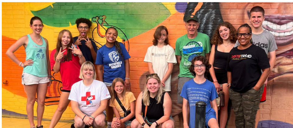
Dinner at Taste of the Triad