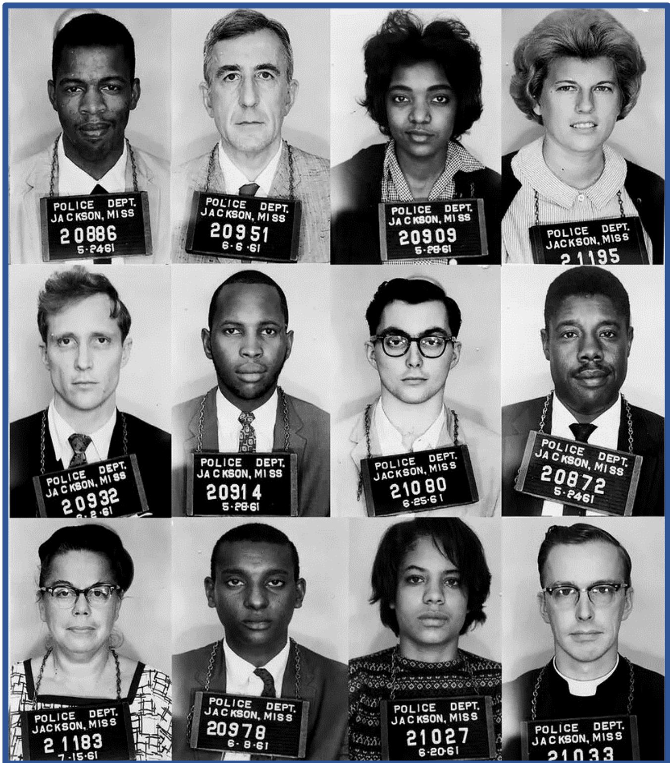
“An Interracial Group of Freedom Riders Arrested in Jackson, Mississippi in 1961 for protesting Segregation”