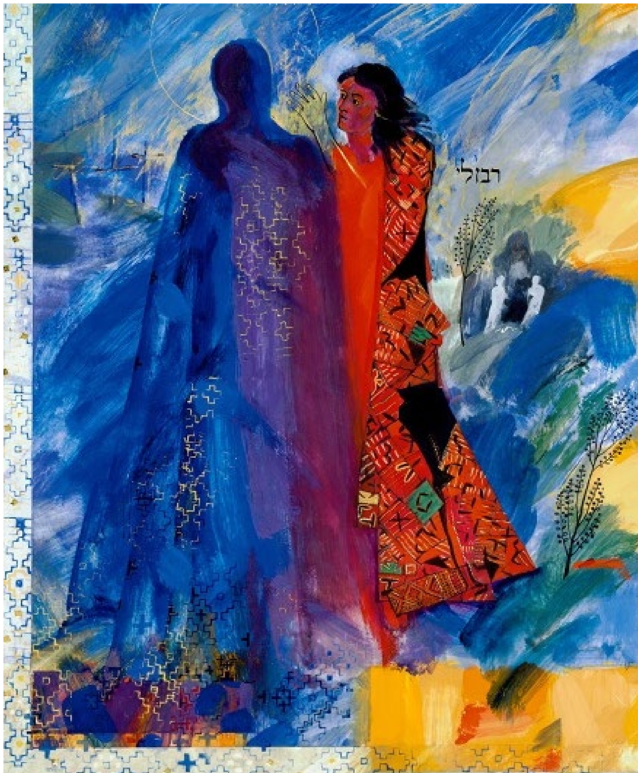
"Resurrection," Donald Jackson, Copyright 2002, The Saint John's Bible