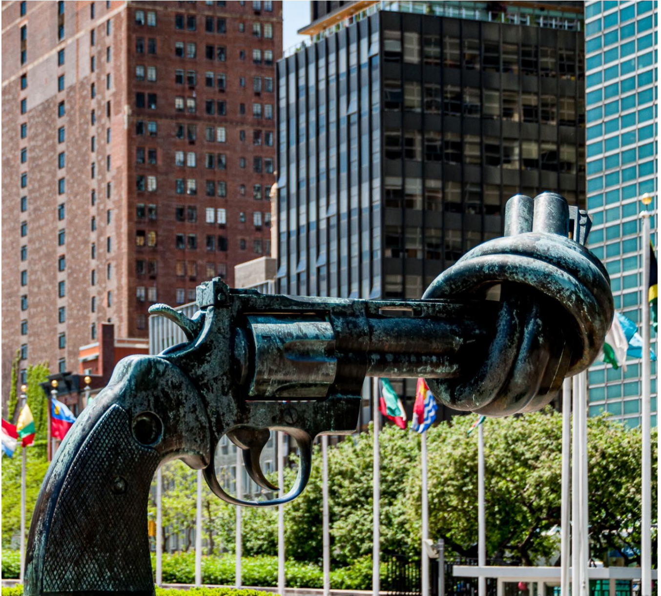
Photo of Non - Violence by Carl Fredrik Reuterswärd Located outside the United Nations headquarters in New York City