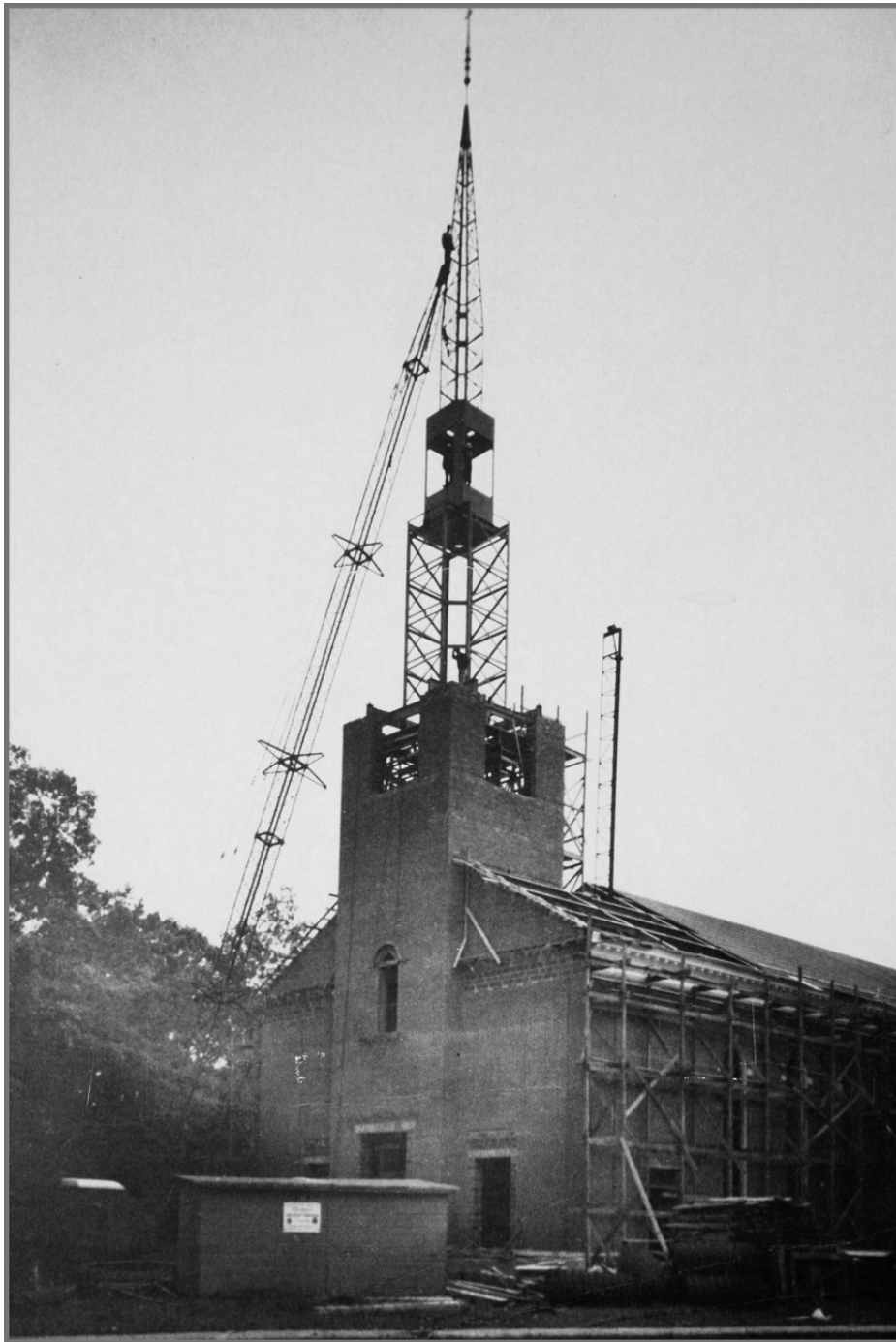
Building of the Myers Park Baptist Sanctuary, c. 1952