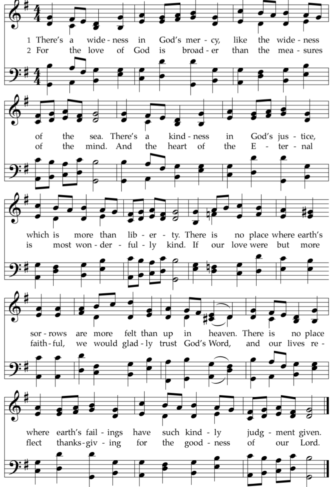
These stanzas, excerpted from quite a few more, offer a reminder that the model for our dealings with others should be God's generosity rather than limited human tolerance. The text is effectively set to a broad and sturdy Dutch folk melody, probably from the 17th century.