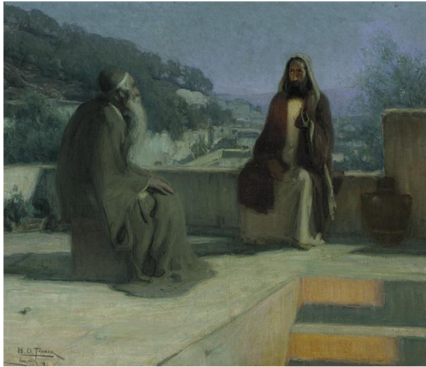
"Jesus and Nicodemus" Henry Ossawa Tanner