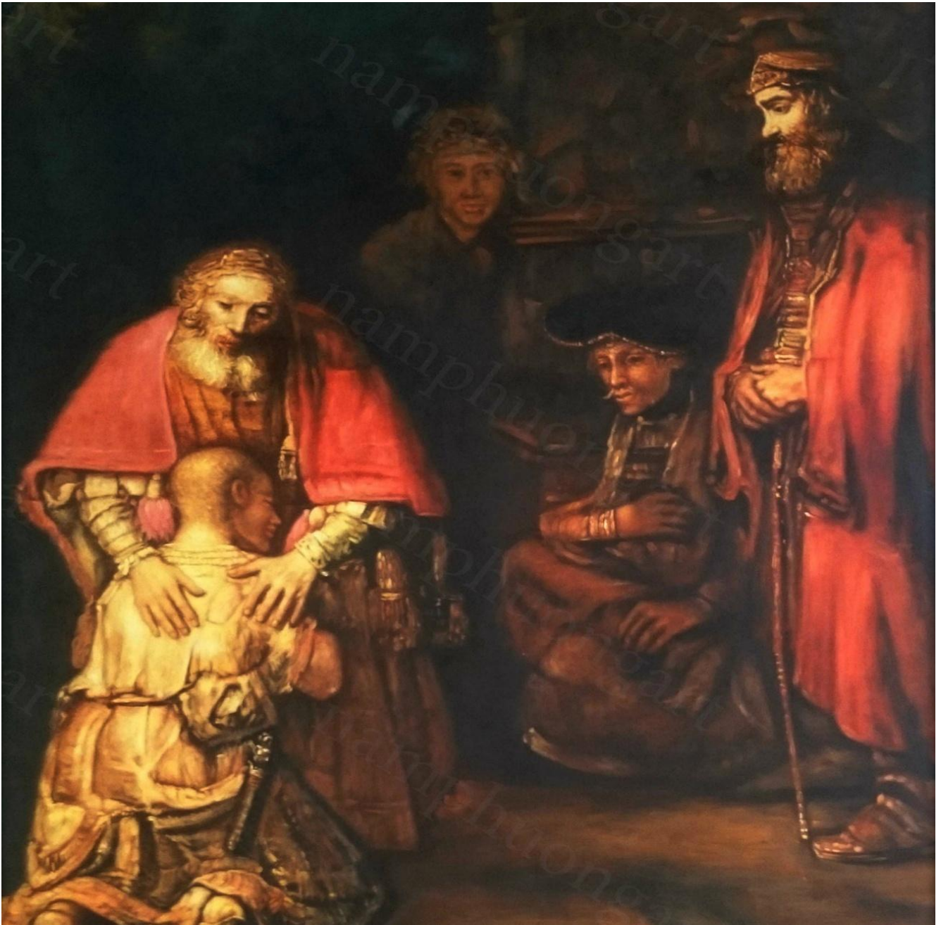
Rembrandt van Rijn, The Return of the Prodigal Son , c. 1669, oil on canvas, 262 × 205 cm, State Hermitage Museum, St. Petersburg, Russia.