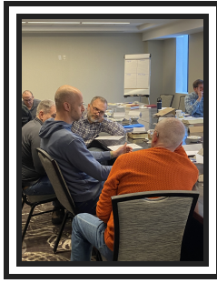
Leaders at work

I'm not an answer-giver in this process. I provide a framework of biblical principles and invite their participation. This means orchestrating learning rather than lecturing. I create settings where leaders explore and discover new insights from the Scriptures and through discussion. After all, who wants to listen to me talk for eight hours.