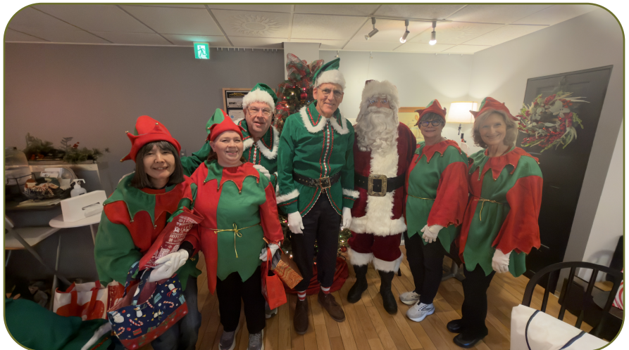
Christmas Tract Outreach