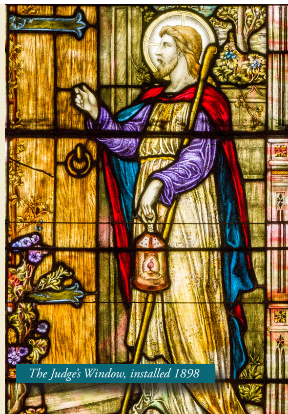
The Judge's Window, installed 1898

Let people know you are part of St. David's by using car stickers, sharing sermons, social media posts, etc. Invite friends to come to church with you.