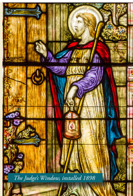
The Judge's Window, installed 1898

Let people know you are part of St. David's by using car stickers, sharing sermons, social media posts, etc. Invite friends to come to church with you.