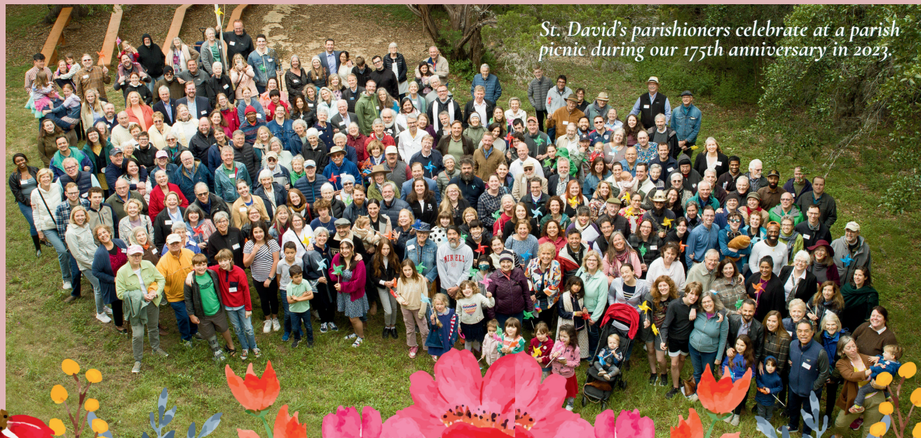
St. David's parishioners celebrate at a parish picnic during our 175th anniversary in 2023.

We've reserved the tables and benches with plenty of room for everyone. We'll provide the fried chicken. Bring your favorite potluck sides and picnic salads to share. Dress casually and stick around for an all-parish photo!