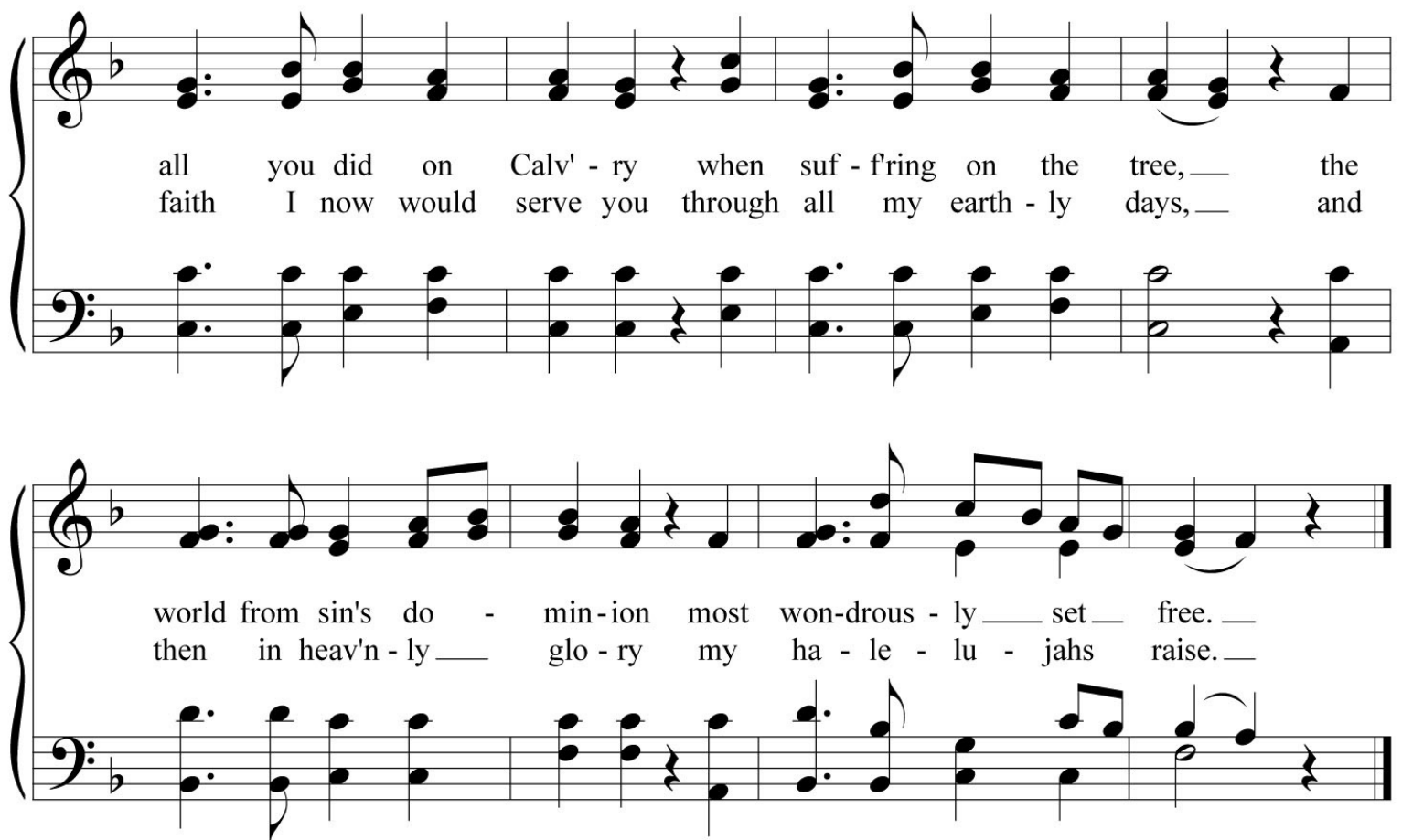
Lord Jesus, you are worthy

We thank you especially for your gifts to the Moravian Church: devotion to the Savior, simplicity, our strong sense of community and fellowship, and our long-standing dedication to spreading your gospel.