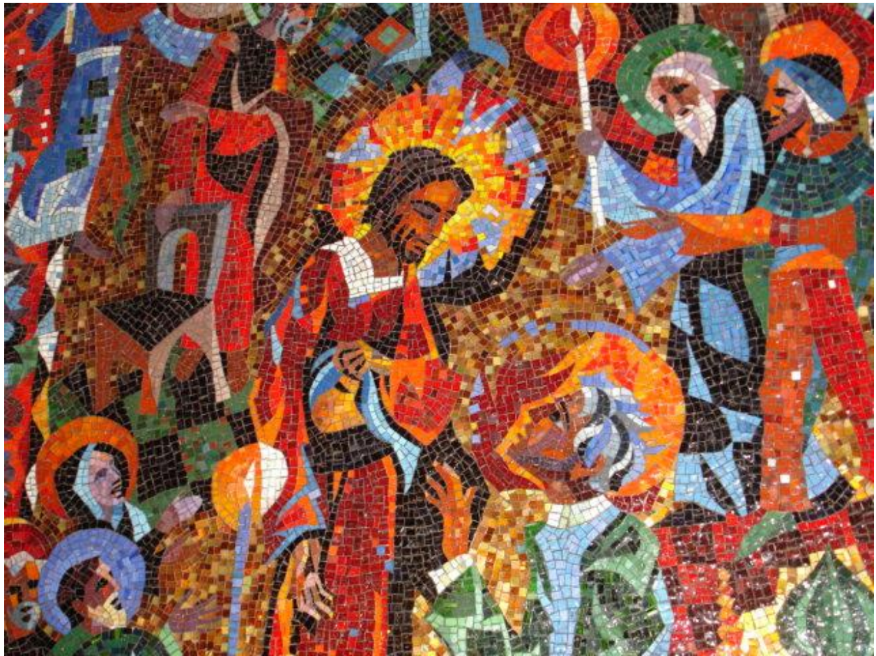
Jesus and Thomas – National Cathedral