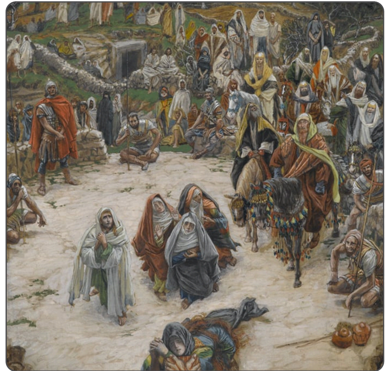
James Tissot (Nantes, France, 1836–1902, Chenecey-Buillon, France). What Our Lord Saw from the Cross (Ce que voyait Notre-Seigneur sur la Croix), 1886–1894.