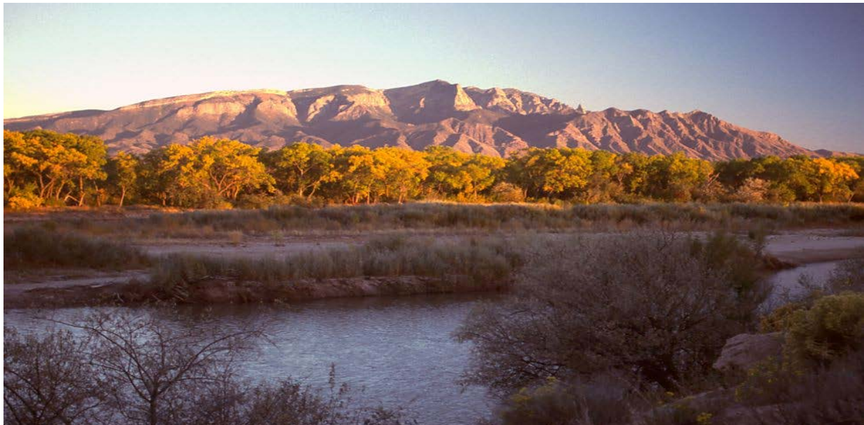
A view of the Sandia Mountain Range as viewed from the West Side of Albuquerque

God has placed SPC in a unique convergence of location, demographics, and opportunity. SPC is located in the Far Northeast Heights of Albuquerque, a metropolitan area of just under a million. Albuquerque is located in north-central New Mexico at the intersection of I-40 and I-25. The church is accessible via Paseo del Norte, a prominent east/west arterial. The Paseo del Norte corridor is exceedingly well-traveled and spans from the foothills of the Sandia Mountains in the east to Albuquerque's "west side", a rapidly growing area of the city.