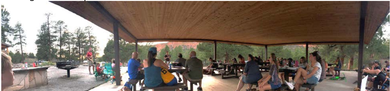
The Family Fall Campout is where families camp together in the Jemez family campground to begin the school year.

Fellowship events allow us time to get to know one another and share one of God's greatest blessings – friendship!