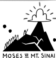
MOSES ON MT. SINAI