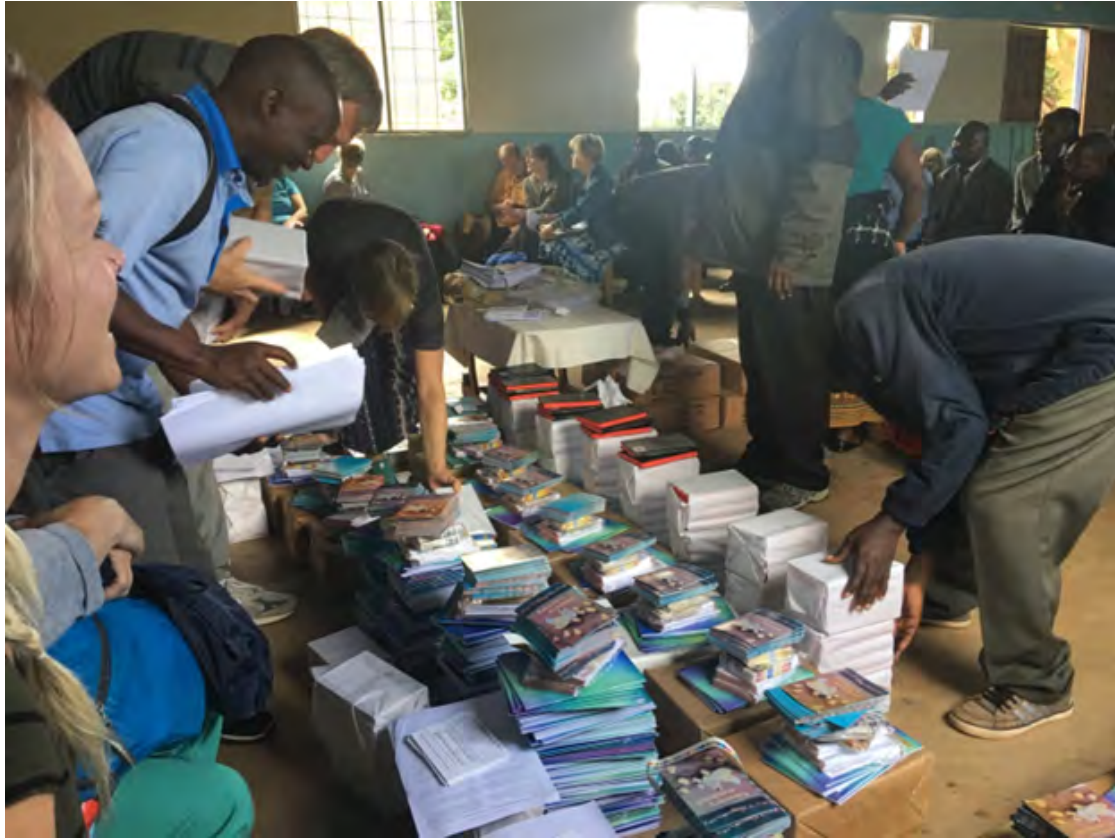
Teams Organizing Bible, Gospel and training material for work in the field