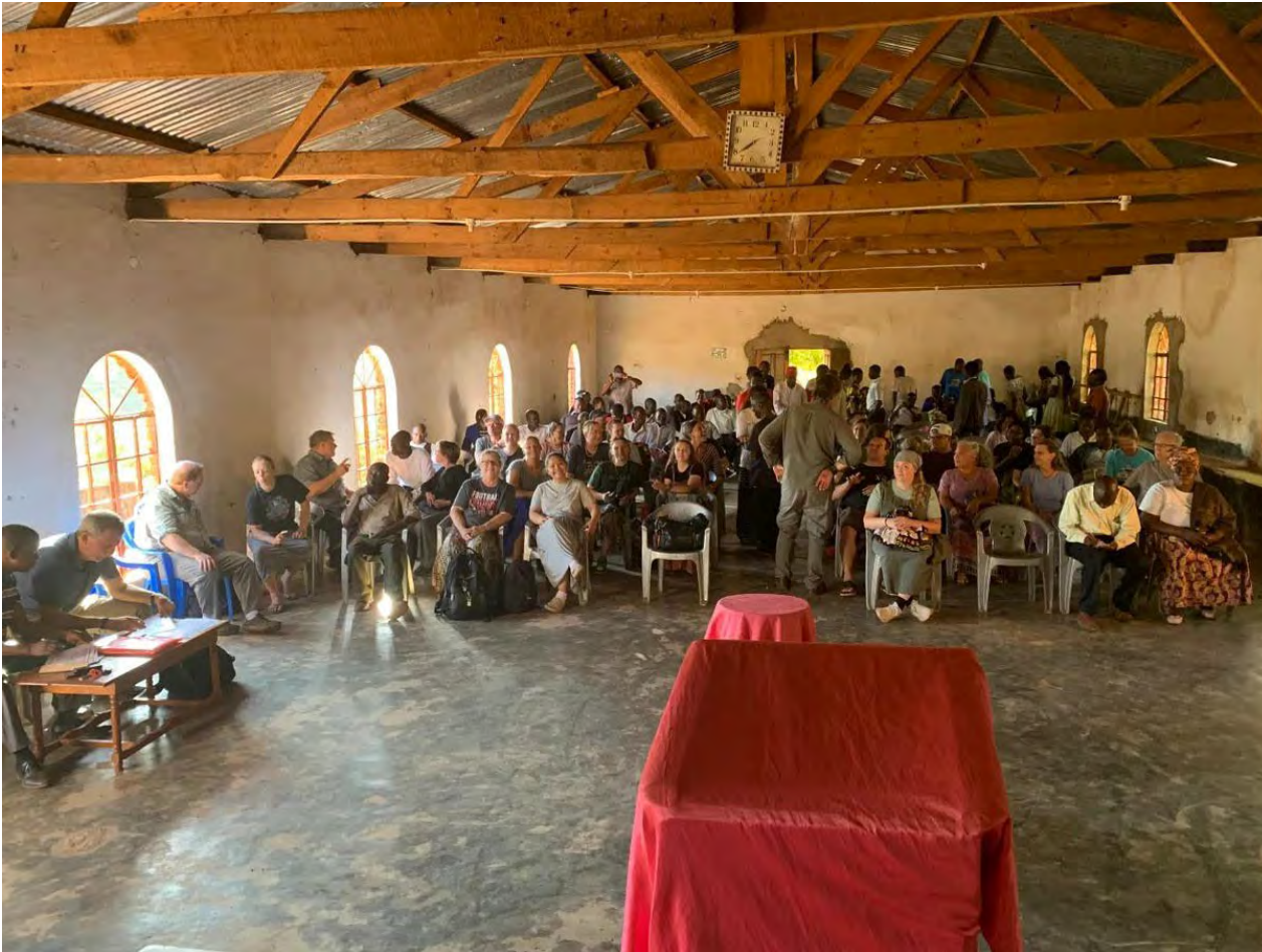
Church Service with volunteers and local leaders