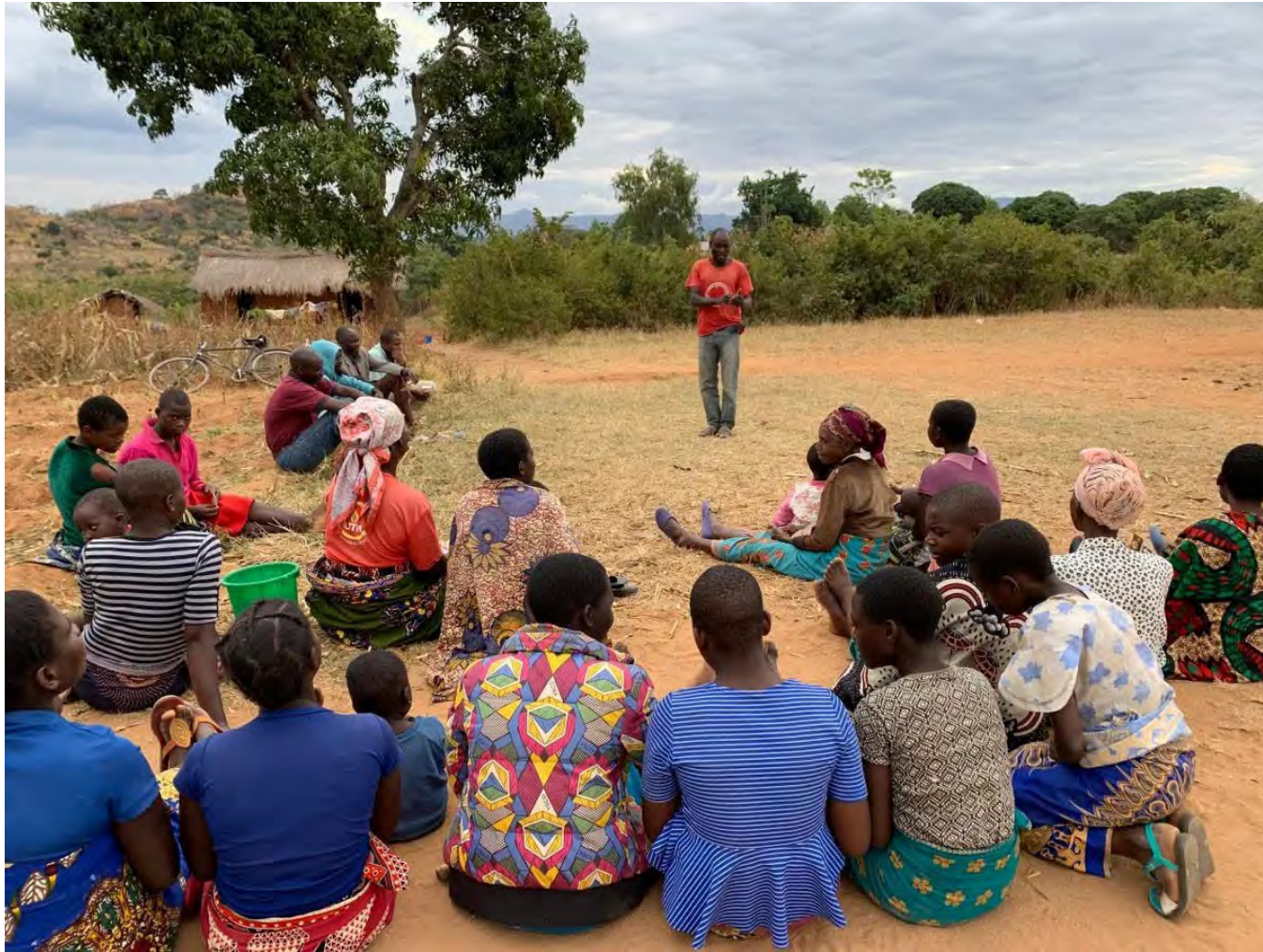
Church Planter with small village meeting