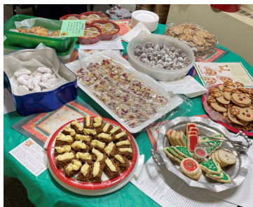
SIM cookies at the "swap"