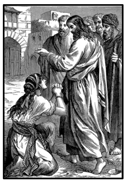
"The Woman of Syrophoenicia," Woodcut from an American Bible, c.1868

Welcoming Neighbors - Nurturing Faith - Transforming Our World