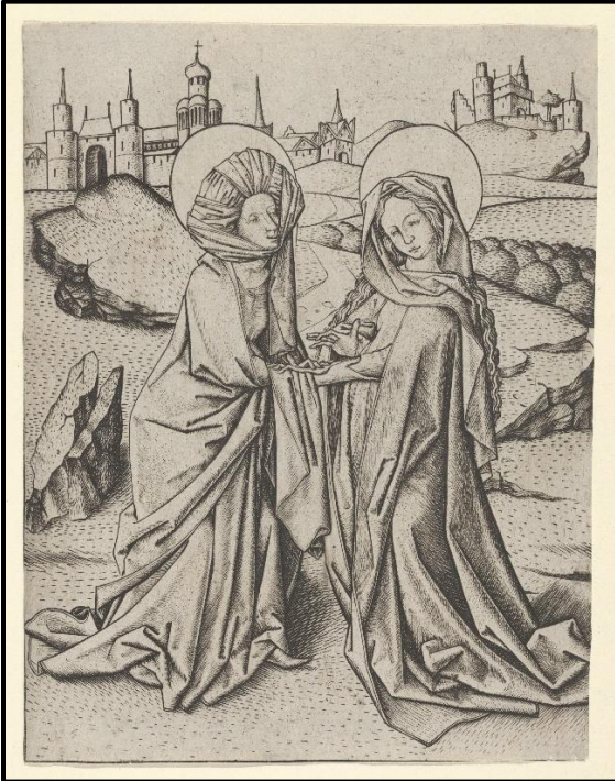
"The Visitation," Master E.S. Copperplate engraving, Germany, c. 1455