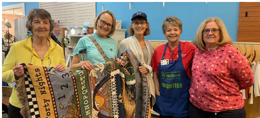
Hands on Mission at Restore