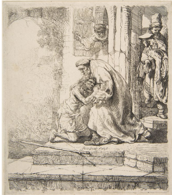
"Return of the Prodigal Son," Rembrandt van Rijn