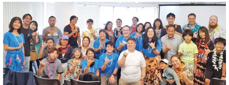
After worship service at the Osaka International Baptist Church