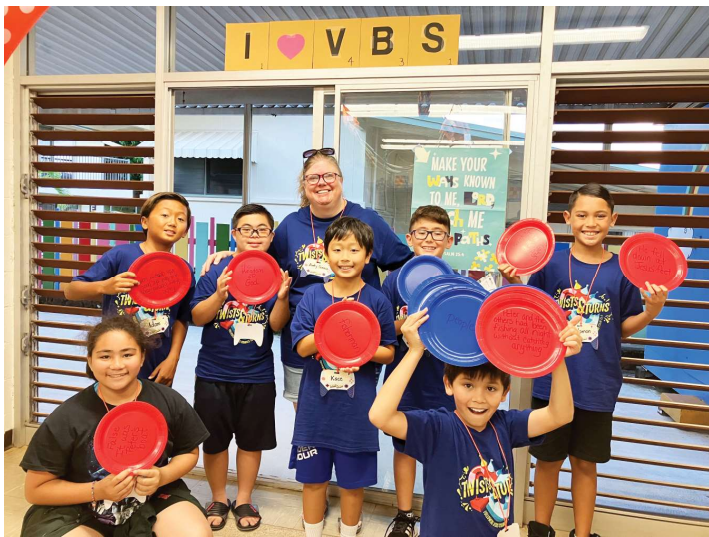
From young to older and local to mainland, our VBS (Vacation Bible School) was enjoyed by all. This year, we teamed up with the mission team from First Baptist Hendersonville, TN.