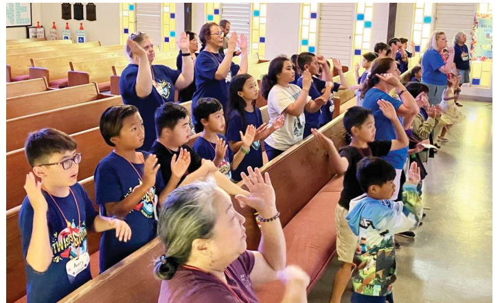
Theme Verse: "Make Your ways known to me, Lord. Teach me Your paths." —Psalm 25:4