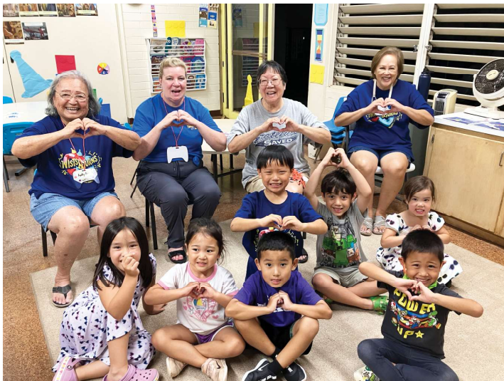
We enjoyed "Twists and Turns" every night, Monday-Friday from June 19-23, 2023.