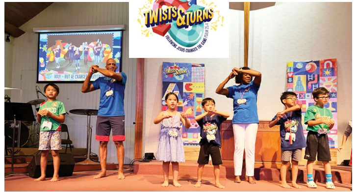
Jesus is holy! Jesus is trustworthy! Jesus is forgiving! Jesus is worth following!