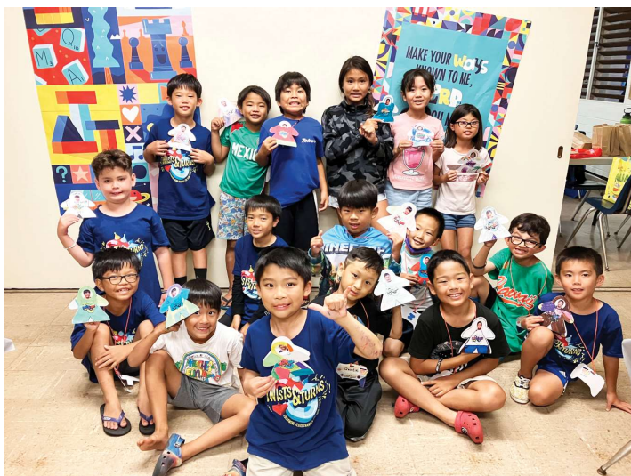
38 children attended with 15 coming for the first time! We also had 35 helpful volunteers!