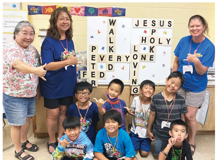
We want to express our appreciation to those who volunteered in person and prayed over this awesome experience! Stay tuned for VBS 2024 🙏