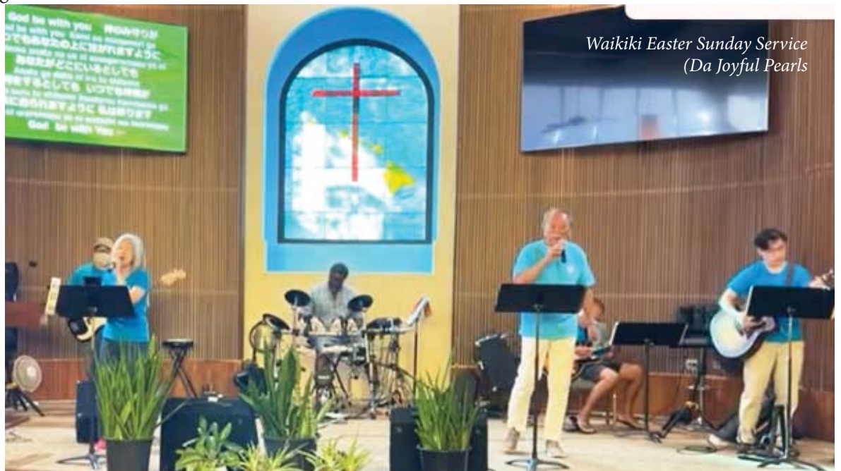
Waikiki Easter Sunday Service (Da Joyful Pearls)