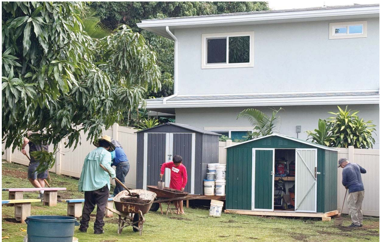
The Building and Grounds crew with other volunteers hard at work prepping the church grounds for Easter.