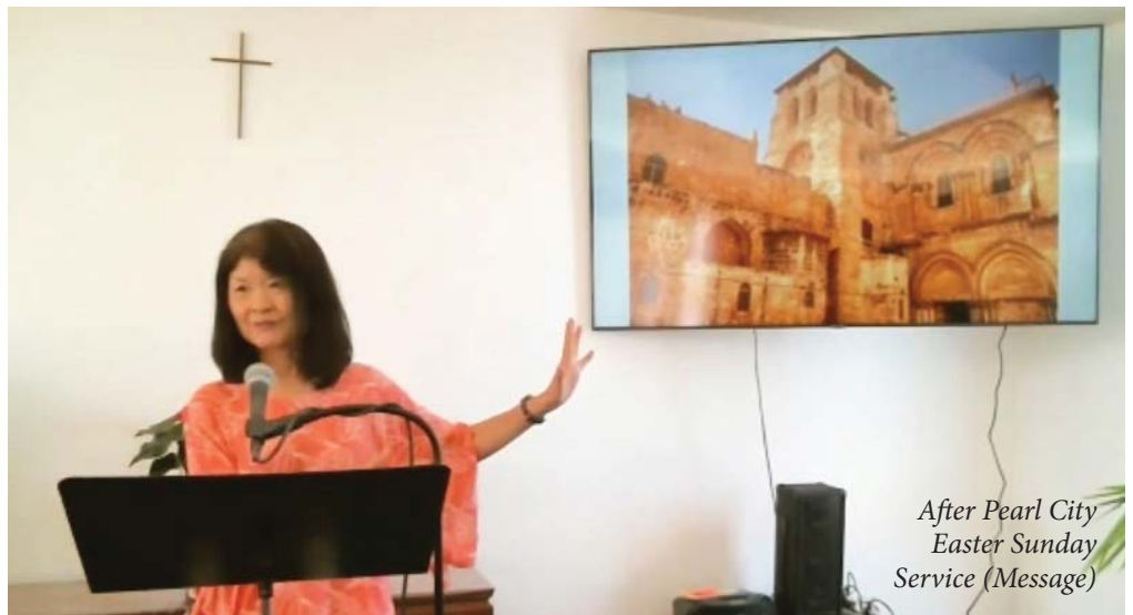
After Pearl City Easter Sunday Service (Message)