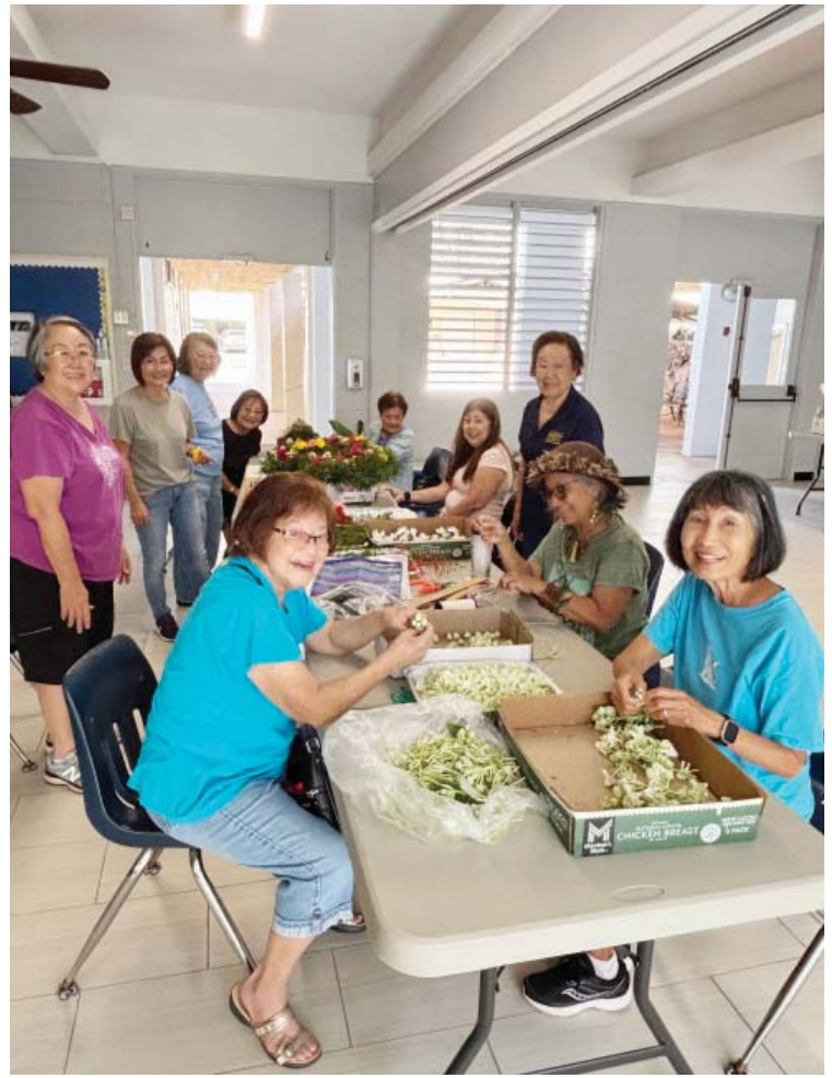
The dedicated women of the Flower Committee.