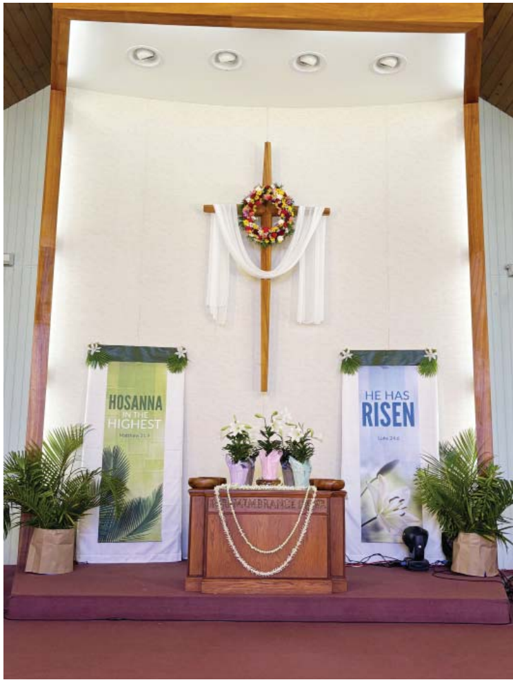
The Flower Committee beautifully decorates the sanctuary.