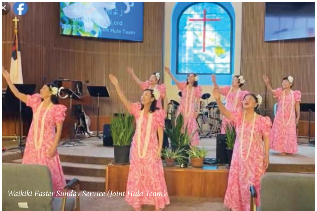
Waikiki Easter Sunday Service (Joint Hula Team)

The risen Christ is not a distant figure from history—He is here, now, in our lives. He moves within us, strengthens us in our suffering, and leads us in His unfailing love. As we continue to rejoice in the victory of Easter, may we carry this truth in our hearts: He is risen. He is with us. Hallelujah!