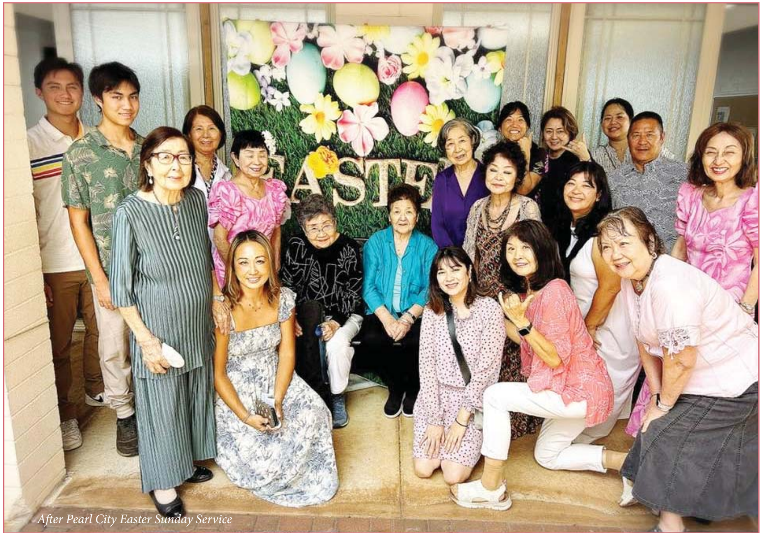
After Pearl City Easter Sunday Service