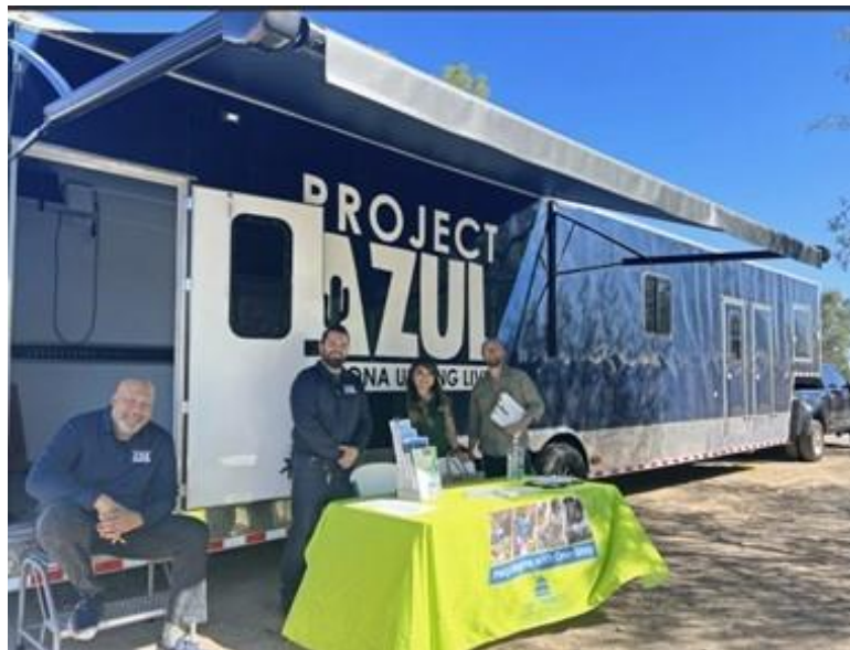
Sahuarita Food Bank and Community Resource Center's Project AZUL Mobile Unit brings help to the community.