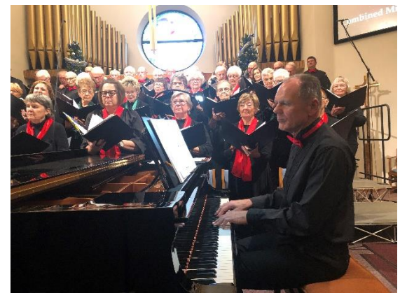
Enjoy the DHLC ensembles as they raise their voices and rejoice at the birth of Christ.

Christmas Eve Dinner will be served at 2 pm in the Fellowship Hall. What a wonderful way to both worship and enjoy a meal with fellowship. No need to dirty your kitchen.