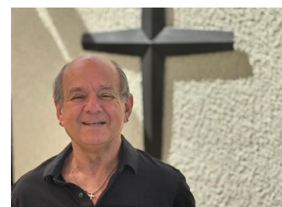
Bruce became a member of DHLC in March 2023.

To sign up or to learn more, contact the church office.