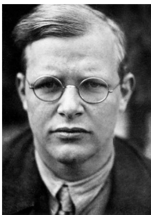
Dietrich Bonhoeffer, German Lutheran pastor, theologian, and anti-Nazi dissident