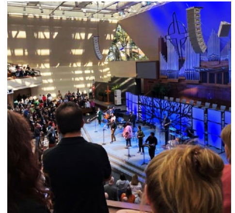
HEAVENLY WORSHIP WITH 1000+