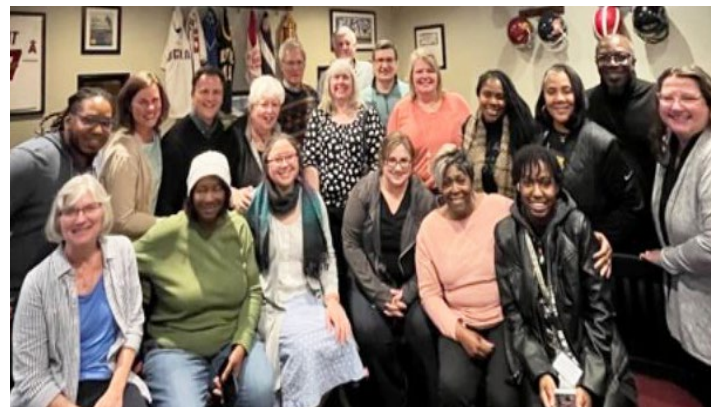
THE CHPC TEAM FINAL NIGHT DINNER INCLUDED FAMILY AND FRIENDS