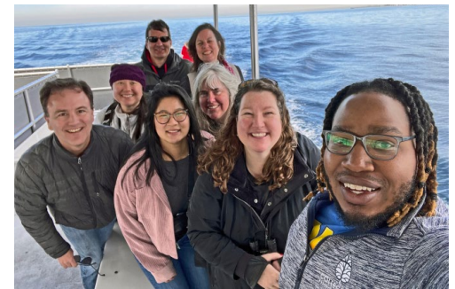
PRE-GATHERING WHALE WATCHING, BUT NOT SEEING!