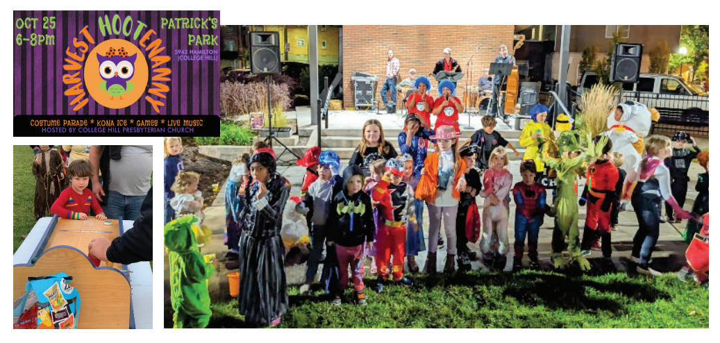
CHPC HOSTED CHILDREN AND THEIR FAMILIES AT PATRICK'S PARK. KIDS SHOWED OFF THEIR COSTUMES, ENJOYED GAMES, TASTED KONA ICE AND LISTENED TO MUSIC.