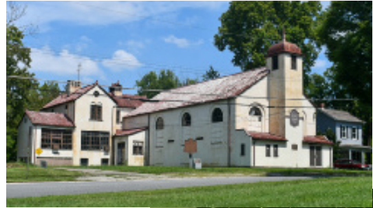
ECKSTEIN SCHOOL AND THE LARGE INTERIOR SPACE

An historic African American Elementary School was at risk of substantial demolition. Then, the Cincinnati Preservation Association purchased the Eckstein School in the village of Glendale, Ohio, as a National Historic Landmark. The current owner is the 42 Washington Ave., LLC. The elementary school was in operation from 1915 to 1958 and served the African American students of Glendale. The purchase will ensure that the historic site is preserved and developed as the Eckstein Cultural Arts Center (ECAC).