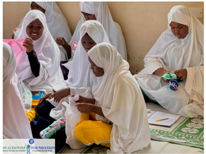
GIRLS EXCITEDLY EXAMINE THEIR NEW DIGNITY KITS.

for His guidance and provision. The Healthwise team has developed great video capability. To see video of the time in the school, go to: https://www.youtube.com/watch?v=JHNmIZ8LI7Y , or go to YouTube.com and type in Donating sanitary to girls at Kajjado school . Come share the excitement that God made possible through Delivering Dignity . More at Delivering-Dignity.com .